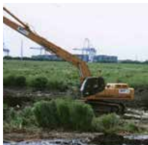
Savannah Dike and Weir Improvements Savannah, GA