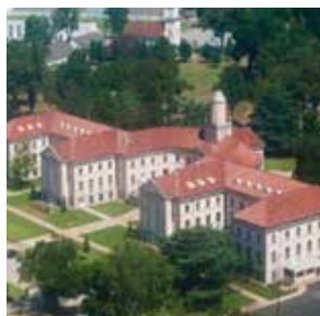
Building 35 - The Infantry School Fort Benning, GA