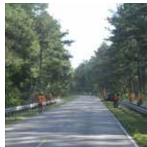
Savannah River Nuclear Site Aiken, SC