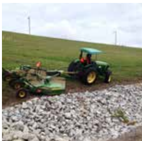
Savannah River Nuclear Site Aiken, SC