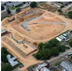
Spirit Communications Park Columbia, SC