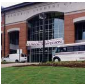
Hendrix Student Center Clemson U, SC