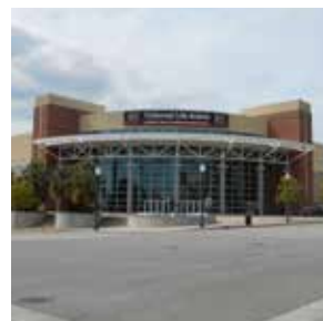
Colonial Life Area University of SC, SC