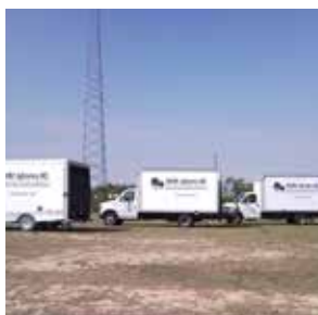
ENVIRO Fleet Columbia, SC