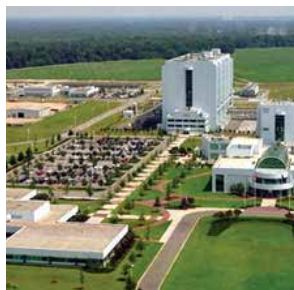
Roche Pharmaceuticals Florence, SC