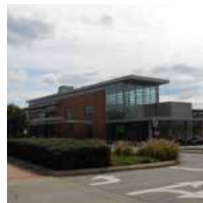
Columbia Metropolitan Convention Center Columbia, SC