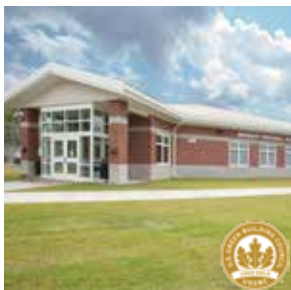
MCI East Pre-Trial Detention Center Camp Lejeune, NC