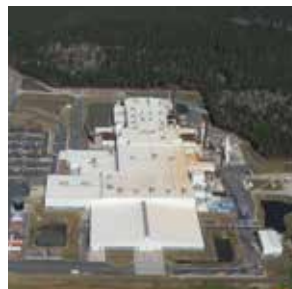
Johnson Controls Battery Recycling Plant Florence, SC