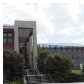
Soldier Support Center Fort Jackson, SC