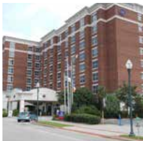
Hilton Hotel Columbia, SC