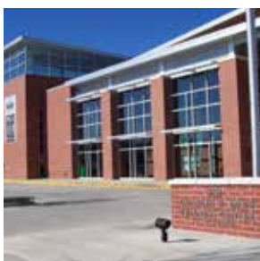
Drew Wellness Center Columbia, SC