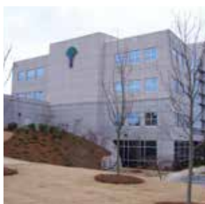
Palmetto Health System Columbia, SC