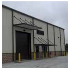
TASC Warehouse Fort Benning, GA