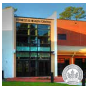
Fitness Center Renovations Shaw AFB, SC