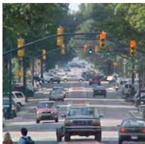
Main Street Streetscapes Columbia, SC