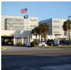
Charleston County Detention Center Charleston, SC