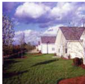
Capital Heights Lawn and Streetscapes Columbia Housing Authority, SC