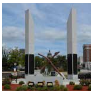
9/11 First Responders Memorial Columbia, SC