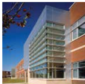
Blythewood High School Richland County, SC