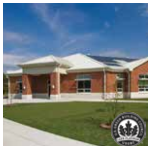
French Creek Mess Hall Camp Lejeune, NC