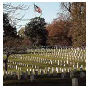
Alexandria National Cemetery Pineville, LA