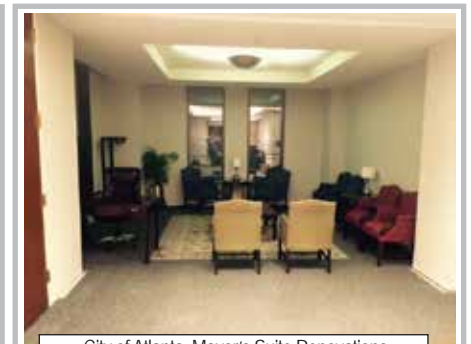
City of Atlanta: Mayor's Suite Renovations