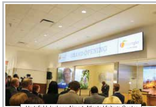
Hartsfield-Jackson Airport: Atlanta Visitor's Center