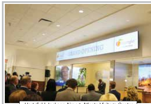
Hartsfield-Jackson Airport: Atlanta Visitor's Center