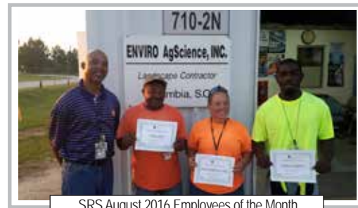
SRS August 2016 Employees of the Month